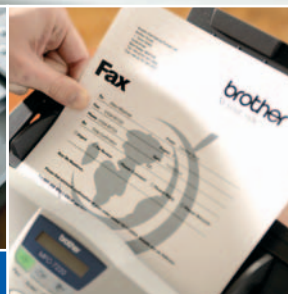
Sheetfed ADF up to 20 pages