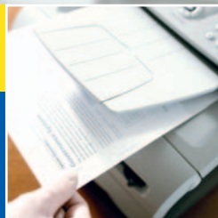
Print speeds up to 20ppm

Laser Printing • Laser Faxing • Laser Copying • Monochrome Scanning • PC Faxing