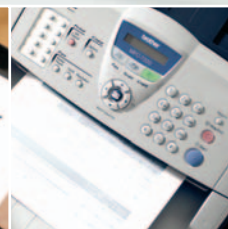
Copy speeds up to 20cpm