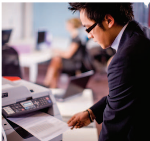
Create an instant impact - with quick 28ppm A4 printing.