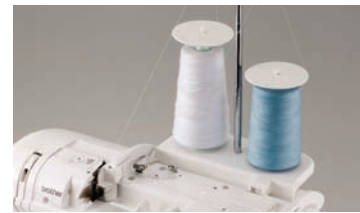
2-pin spool stand Detachable large 2-pin spool stand for large spool thread delivery or easy twin needle sewing.