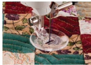
Echo "E" foot For perfect Echo quilting.