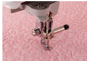
Free Motion "C" foot For beautiful straight-stitch stippling.

Includes three new free-motion presser feet and 2-pin spool stand