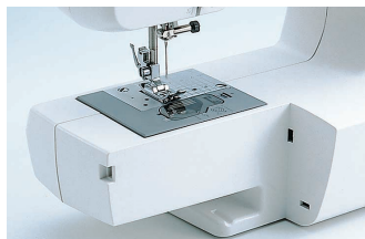
Free arm sewing