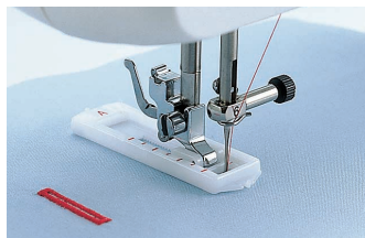
4-step automatic buttonholer