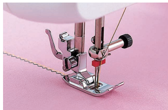
Twin needle for two-colour stitching