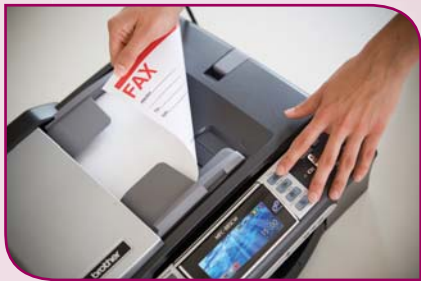
*ITU-T No.1 Chart, Standard Resolution **Applicable for Windows® only

Print, Fax, Copy and Scan – all great features packed into a tiny footprint that fit into tight corners and small workspaces. MFC-885CW's fax capability allows for colour faxing of up to 100 speed dials, through a 14.4K bps modem. This translates to an incredible speed of approximately 6 sec* per page. In addition, the 32MB memory stores up to 400 pages* of outgoing and incoming faxes.