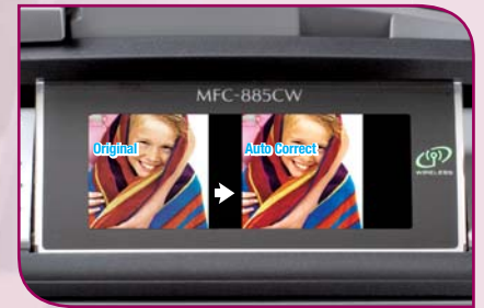
View before & after photo editing: Auto correct of skintone colours

With the bundled easy-to-use photo editing software, the wide screen is useful for viewing images before and after editing. Other capabilities include image cropping and viewing a slideshow of the images on the media card.